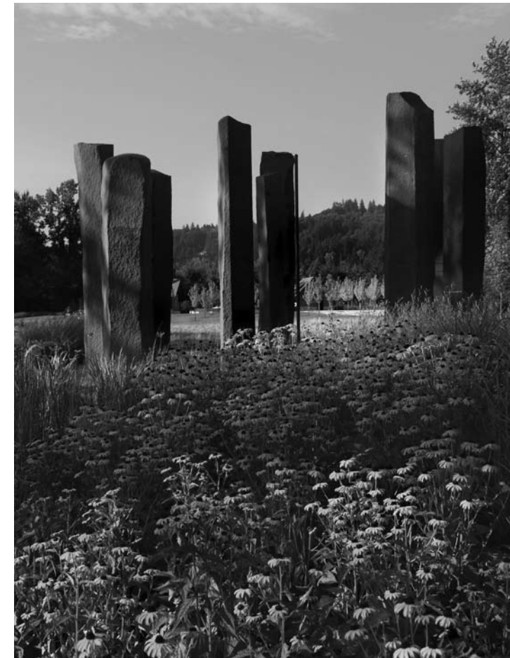
Stafford Stones at Foothills Park, Lake Oswego.

• Gift annuities to the Foundation provide a high fixed payout to the giver and an income tax deduction. In addition, a portion of the annuity payment is tax-free. What remains in the gift annuity after the death of the giver becomes an outright donation to the Foundation.