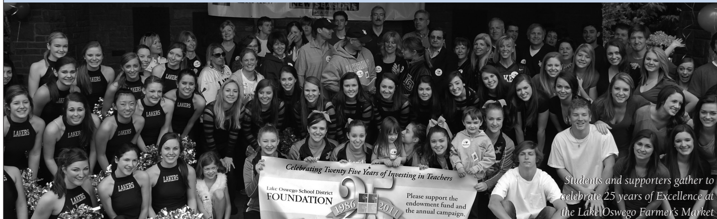
Students and supporters gather to celebrate 25 years of Excellence at the Lake Oswego Farmer's Market

*An asterisk denotes Endowment donors who have included the Foundation in their estate plans.