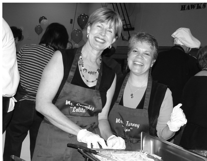
Two of our awesome volunteers making the Foundation spaghetti night a success!

Albertsons Barnard Commerical Real Estate Dyke Vandenberg Jeweler Gone to the Dogs Gourmet Productions, Inc. Kelly's Jelly Peet's Coffee Starbucks